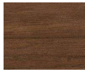
Walnut Wood Texture