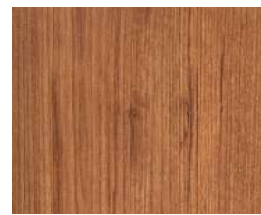
Oak Wood Texture