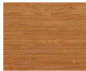
Bamboo Wood Texture