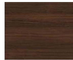
Dark Walnut Wood Texture